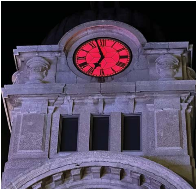
Moose Jaw City Hall's Clock Tower lit up red for Project Red Ribbon .

Our heartfelt thanks to all locations that are helping us spread the sober driving message.