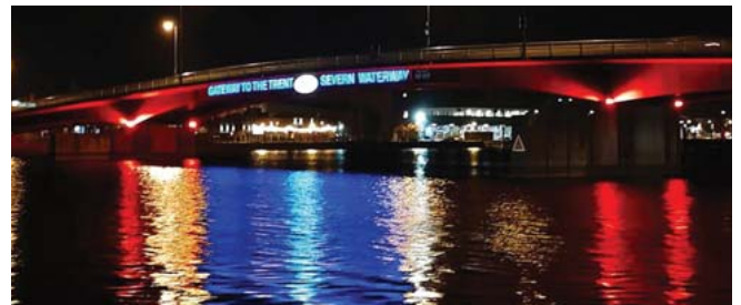
The Gateway to the Trent-Severn Waterway in Quinte West lit up red for Project Red Ribbon .